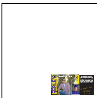
4.9" x 2.3" Eighth pg $95