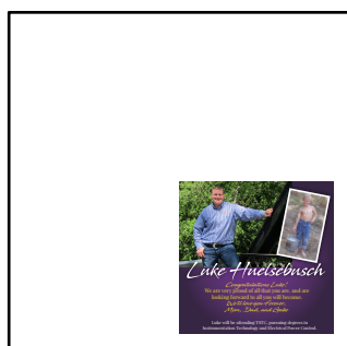
4.9" x 4.8" Qtr Pg $195