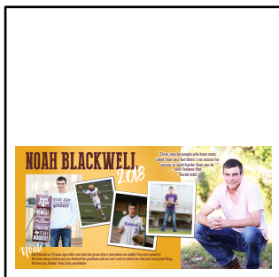
10" x 4.8" Half Pg $295