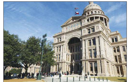
The 87th Texas Legislative session began Tuesday. Above, visitors wait to enter the Texas Capitol during the 86th legislative session.

Zwiener cites virus, education, healthcare as biggest challenges facing legislative session