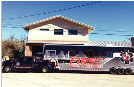
The Mobile Health Truck arrives in Dripping Springs.

As the COVID-19 vaccine rollouts continue in Texas, one Dripping Springs company is hitting the pavement to deliver as many vaccines as possible to their neighbors. Through its mobile vaccination clinic, First Medical Response of Texas (FMR) has been able to administer nearly 400 vaccines in Dripping Springs